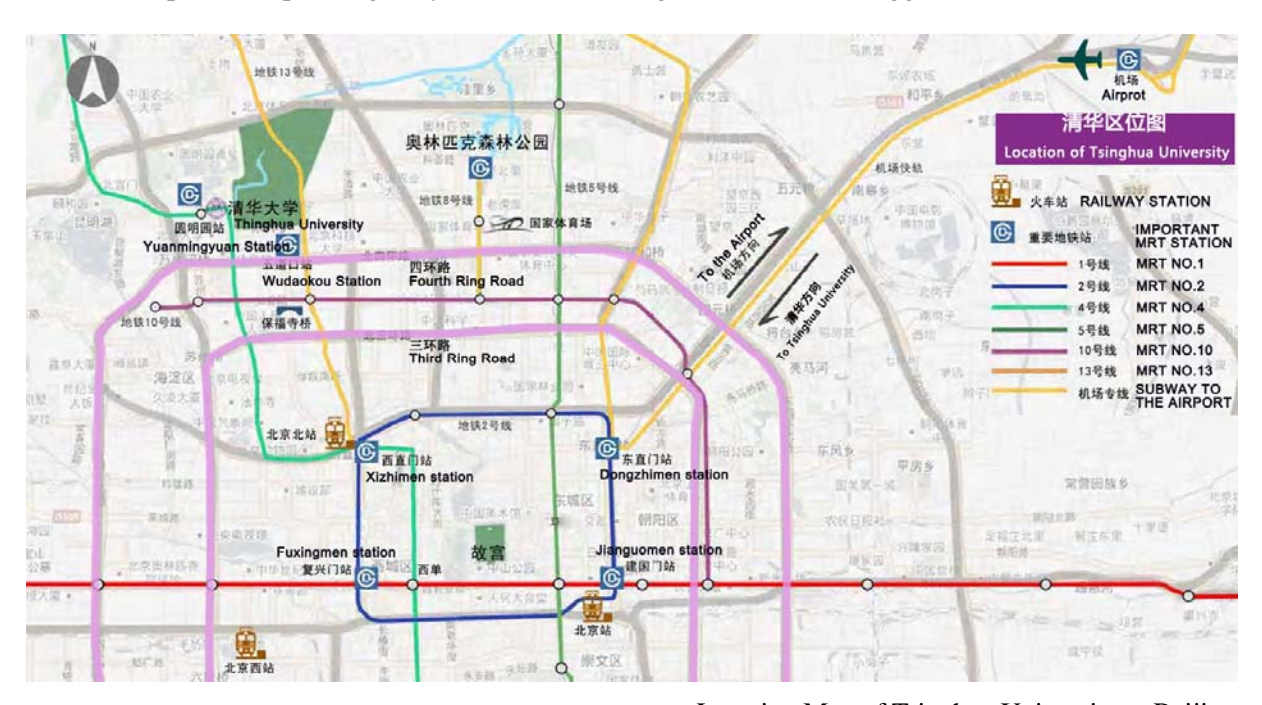
Location Map of Tsinghua University at Beijing

It is much easier to take TAXI from Beijing International Airport to the Hotel. The distance is about 35 KM and the price is about RMB 100-150 Yuan plus airport highway toll, which depends on the traffic. Please show the Chinese information and map to Taxi driver. The most possible route is as follows: Airport—Airport Highway—The Fourth Ring Road—East Zhongguancun Road—Hotel.